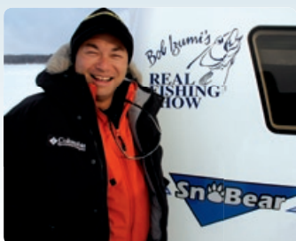
Bob Izumi, Bob Izumi's Real Fishing Show

"The SnoBear brings luxury into the world of icefishing. It allows you to explore and fish areas with all the comforts of home! It's your transportation, ice hut, living room and bedroom all wrapped into the most comfortable way to get the most of your winter adventure! It's a state of the art ice fishing machine!"